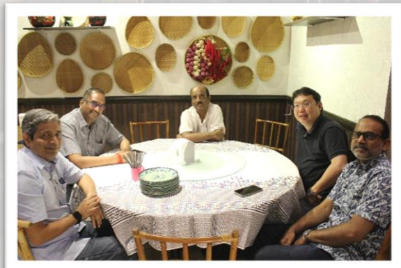
Figure 6 Refreshing dinner at authentic nyonya restaurant