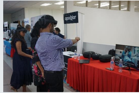
Figure 7 Exploring surgery with hologram medicine