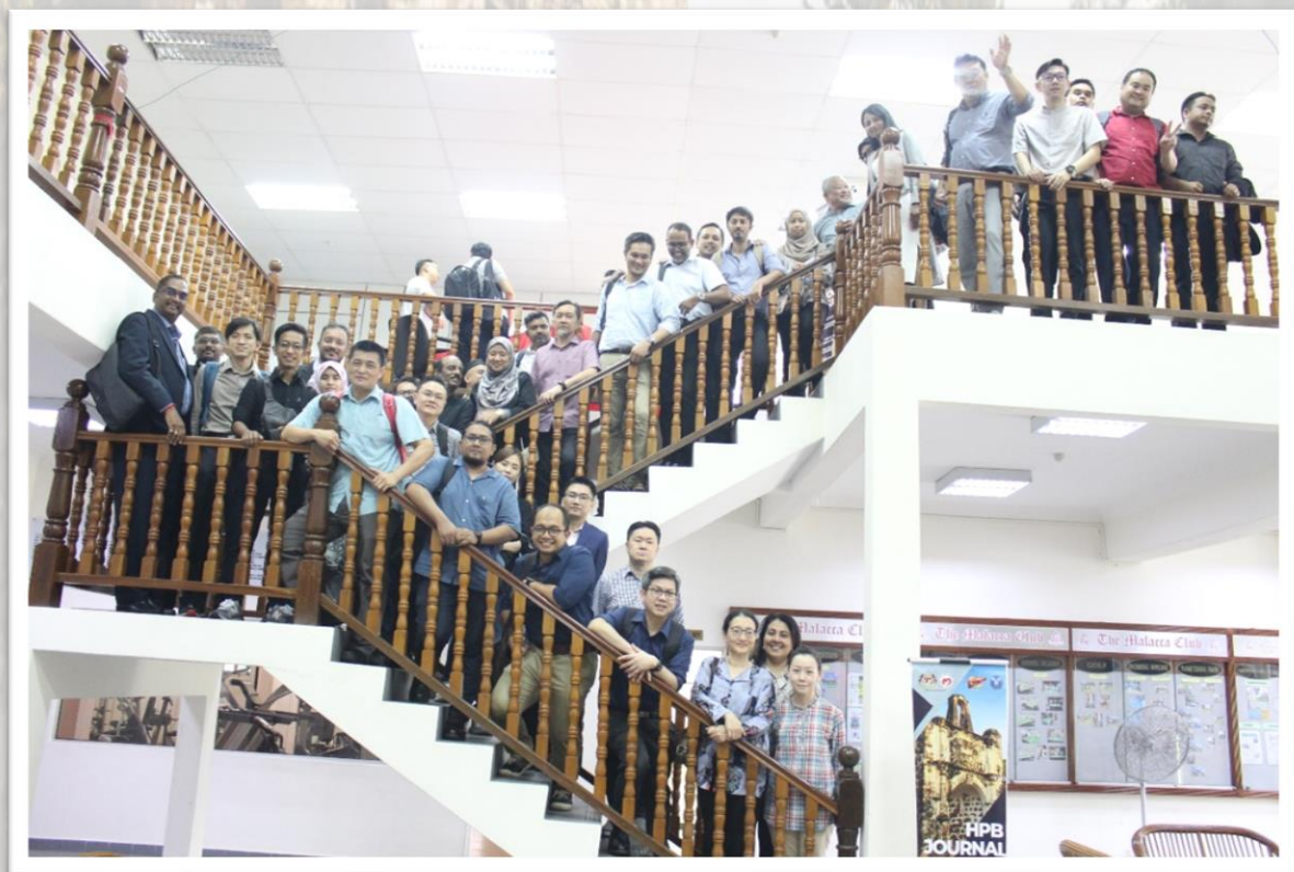
Figure 8 Group photo of HPB Fraternity