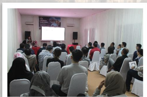
Figure 2 Presentation by trainee