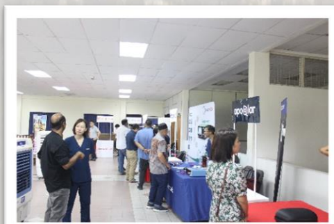
Figure 3 Participation from industrial partners

Despite being a topic not familiar to many of us especially the trainees, many of them were able to grasp the topic and prepare an interesting and captivating presentation. The HPB consultants were able to share their personal experience from their foreign attachment and work locally.